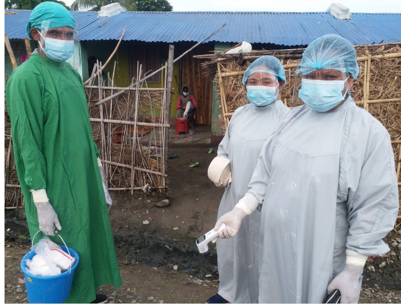
PPE keeps staff and patient families COVID-safe while Ponseti treatments continue at villagers' homes.

HRDC's commitment to reaching important 2030 Sustainable Development Goals in Nepal has created a platform for care-delivery that didn't exist before. Using a culturally sensitive approach, HRDC provides treatment and rehabilitation to the poorest children with disabilities.