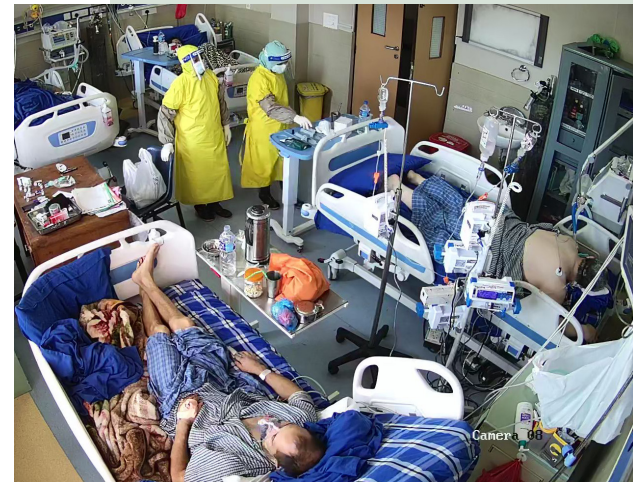
Critically ill patients undergo lifesaving treatment in new COVID ward at B&B Hospital.